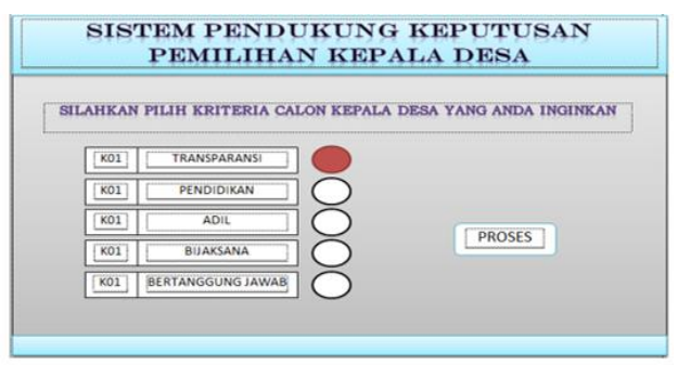
Figure 4. Select criteria page design

For example, on this page the public can make their choice by clicking on the circle next to the criteria, when the community has made their choice, the circle next to the selection criteria will change color as shown in figure 4. After the community has made their choice, the community will continue by clicking the process button, the system will automatically display a page that has finished selecting and continue to see the results as shown in the picture.